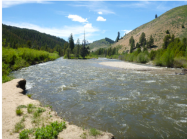
Figure 4: "Bowns Washout" (eastmost washout on Figure 1), work to relocate the road so the south of the current location would begin in 2020.