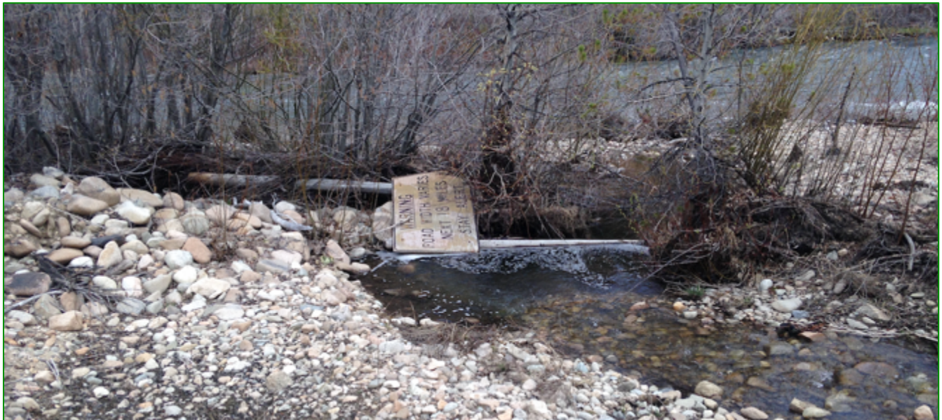
Road and steamed debris from 2017 below Bowns Campground!