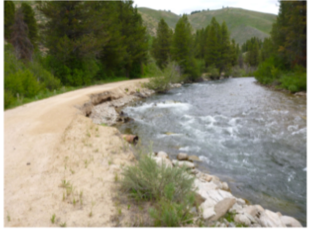
Figure 2: Westmost washout to repaired fall 2019.