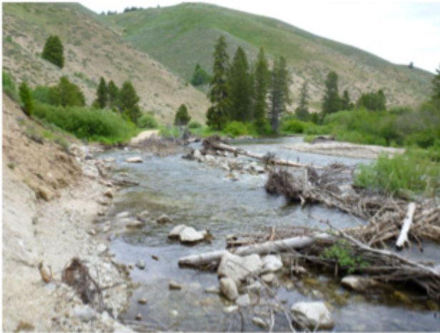
Figure 3: Middle washout, road to be located to the north of its current location.