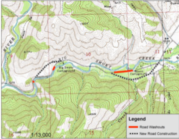
Figure 1: FR 227 washouts and proposed road relocations.