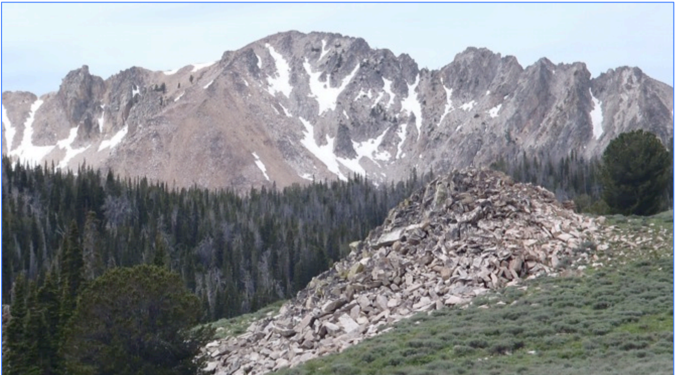
A ridge so close, but still a ridge too far: The North Ridge, North Peak, Fourth Peak!

Loose in the Caboose! Caboose volunteers and family/friends are invited to join in for a festive appreciation of their visitor information services on September 6, a week from Tuesday. Food, of course, will be involved! Lunch ($5) at the Senior Center, following a 10 a.m. tour of the Museum! The Caboose Committee will provide a robust dessert, and will host a debut showing of the new visitor slide show! 🍷